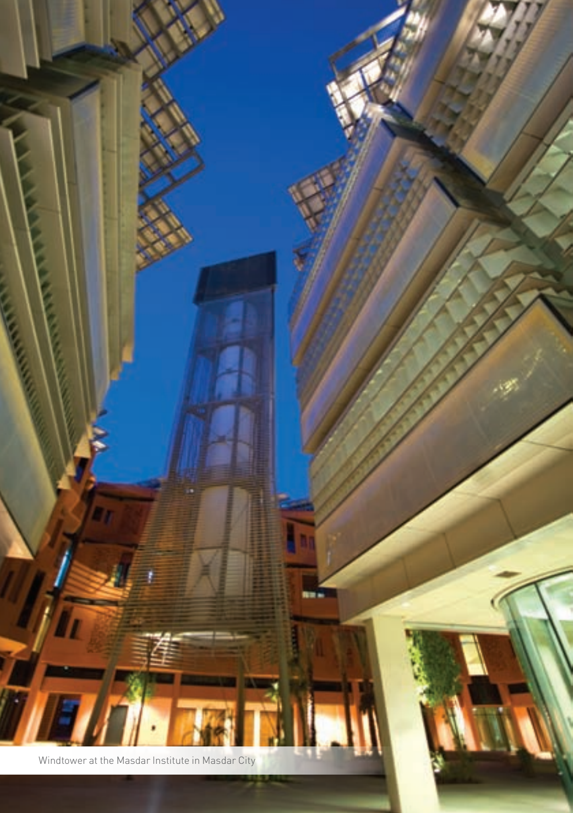
Windtower at the Masdar Institute in Masdar City

Every aspect of licensing and operating from Masdar City – the global centre of future energy – has been refined, and reengineered where necessary, to ensure organisations operating in the city can focus all their resources and efforts on their core activities.